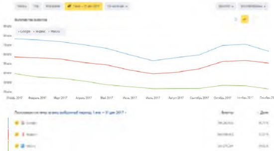
Figure 1 - Number of visits [6]

Yandex, on the basis of its statistics service, which may not be installed on some sites [7]. Therefore, all figures given and used must be taken with a certain degree of skepticism.